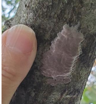
SLF Egg Mass

Be on the lookout for gray putty-like egg masses that are about the size and shape of your thumb. Crushing the egg masses or scraping them off into a baggie with rubbing alcohol will help reduce next year's SLF populations.