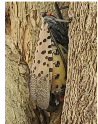
SLF Gravid Female

As the battle against the SLF continues, our local fauna is catching on to help us control these invaders. Some of the observed top predators of the SLF are chickens, cardinals, catbirds, blue jays, tufted titmouse, praying mantids, yellow jackets, orbweaver spiders, wheelbugs, and ants. Research is ongoing for use of biological controls like parasitic wasps and native fungi that are environmental friendly to help with control SLF populations.