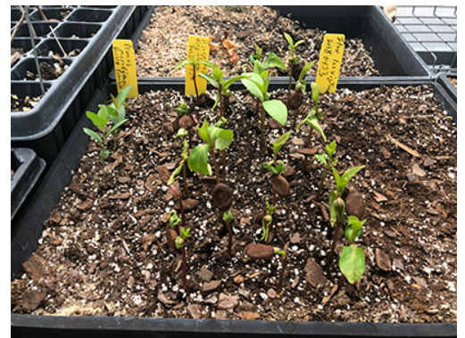
Figure 7. Cotyledons of Diospyros virginiana (Common-persimmon) 3 weeks after sowing.

An even easier method for germinating seeds is to over-winter seeds outdoors. Native plants are accustomed to local climatic conditions and do not need to germinate indoors, in greenhouse-like conditions. Therefore, another option is to plant the seeds in the fall in containers, using the steps outlined above, and leave them outside where they will receive precipitation and cold conditions throughout the winter. They will naturally germinate in the spring once soil temperature increases. It will be necessary to protect your seeded pots from squirrels or birds that may dig in the pots, and possibly from extreme winter winds. Hardware cloth or chicken wire can be laid flat and weighed down with heavy objects over the seeded pots as protection. Monitor the seeded pots in the spring and water them if you notice the pots drying out once the seeds begin to sprout.