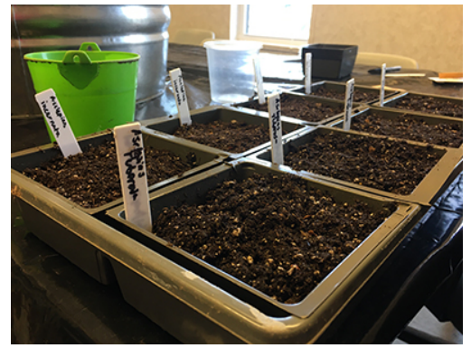
Figure 5. Labeled containers with species name and date planted.

Once the seeds are planted, tent the container with plastic wrap to prevent moisture from escaping. Place the container in a sheltered location in direct sun at a suitable temperature for the seeds. The ideal temperature for most seed germination is 70–75° F. The cover can be removed once the seeds have germinated.