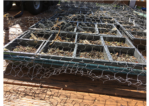
Figure 6. Over-wintering containers with chicken wire for protection.