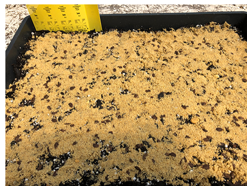
Figure 4. Seed in sand for Asclepias exaltata (Poke milkweed).