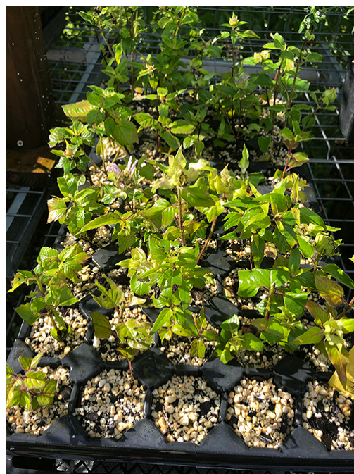
Figure 9. Transplanted Monarda fistulosa (Wild Bergamot) growing in plug trays.