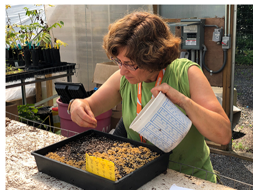
Figure 3. Sowing Asclepias exaltata (Poke Milkweed) seed in sand over planting mix.