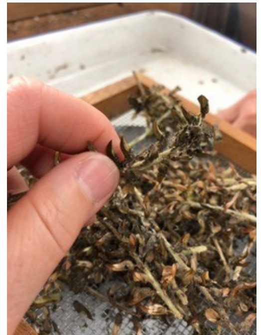
Figure 1. Close up of Pedicularis canadensis (Wood Betony) seed heads.

Plant propagation by seed provides a simple and economical way of raising large numbers of native perennials. By propagating native plants from seed, the genetic diversity of the species will be maintained, which helps create more resilient plant communities. Seeds can be saved for propagation from native plants already growing in your landscape, in family and friend's gardens, and possibly parks and woodlands. However, it is essential to obtain permission from the property owner before collecting any plants or flower heads from private properties or public lands. Contact garden clubs or local libraries and ask about seed banks or exchanges as a resource for native seed.