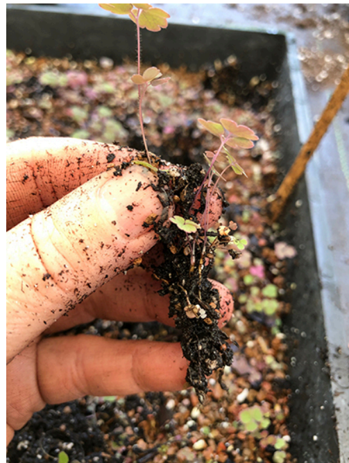
Figure 8. Handling Aquilegia canadensis (Eastern Columbine) seedlings.

Table 1 is a handy chart of 10 Common Native Perennials showing the time of year when the seeds ripen and the proper technique for germination.